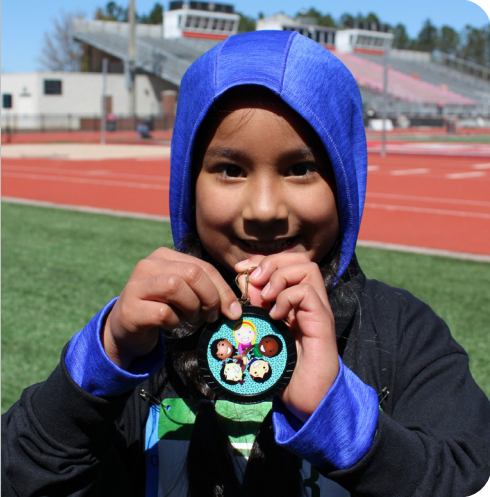
Our youth race winner proudly displays his award. Congratulations!