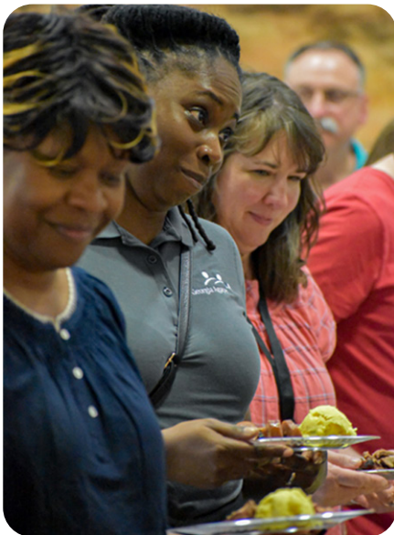
Above and at right: Our community of Church of Christ agencies across the country recently gathered in Lubbock, Texas, for fellowship, encouragement, and inspiration through Network 1:27.