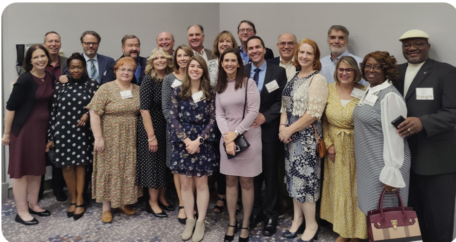
Members of the Grace Chapel Church of Christ at the banquet