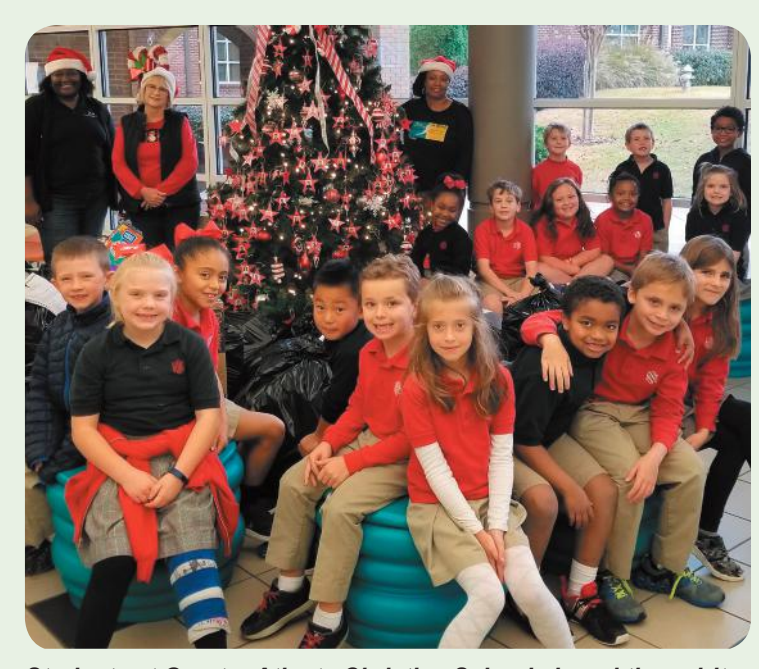
Students at Greater Atlanta Christian School shared the spirit of Christmas by providing gifts for our foster children