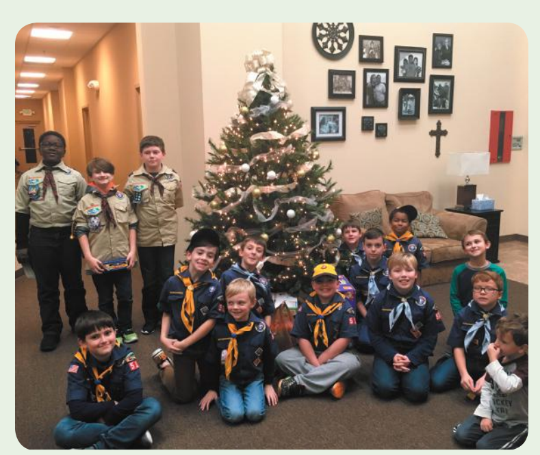
Boy Scout Troup 510 from the Gwinnett congregation who donated diapers and wipes to our foster families